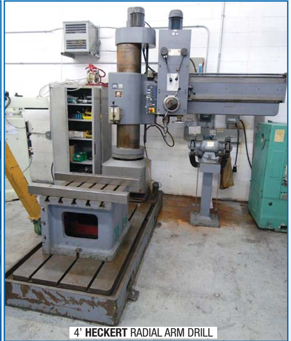
4' HECKERT RADIAL ARM DRILL