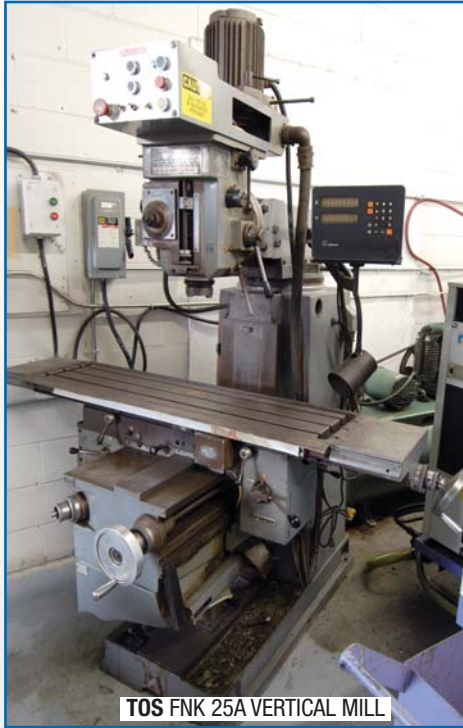
TOS FNK 25A VERTICAL MILL