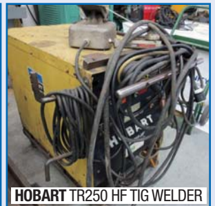
HOBART TR250 HF TIG WELDER