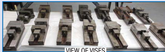
VIEW OF VISES