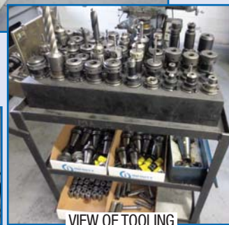
VIEW OF TOOLING