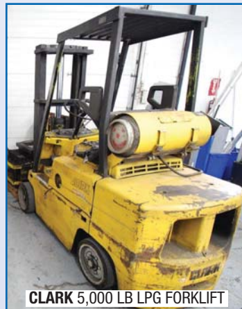
CLARK 5,000 LB LPG FORKLIFT