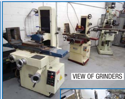
VIEW OF GRINDERS