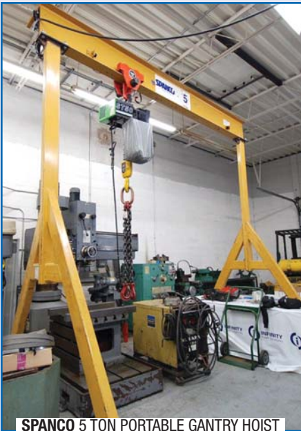
SPANCO 5 TON PORTABLE GANTRY HOIST