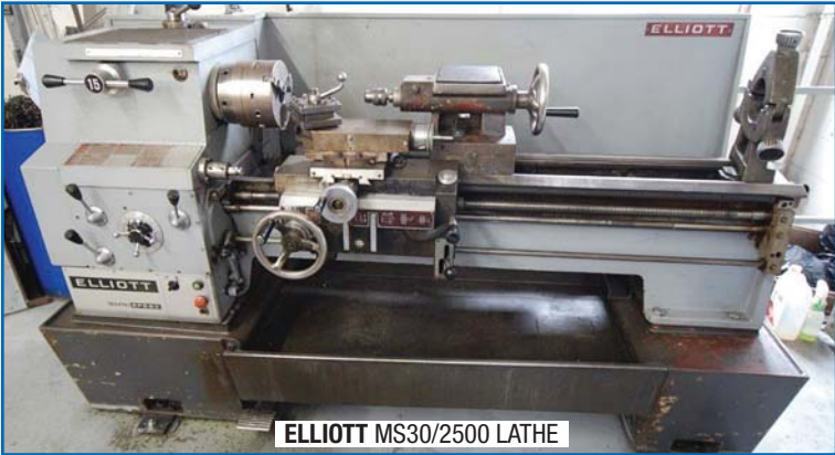
ELLIOTT MS30/2500 LATHE