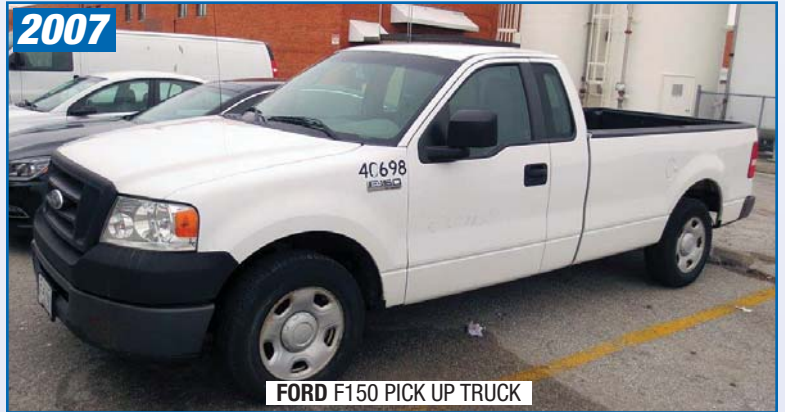
FORD F150 PICK UP TRUCK