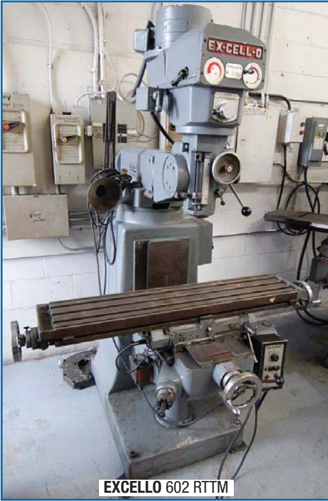
EXCELLO 602 RTT M